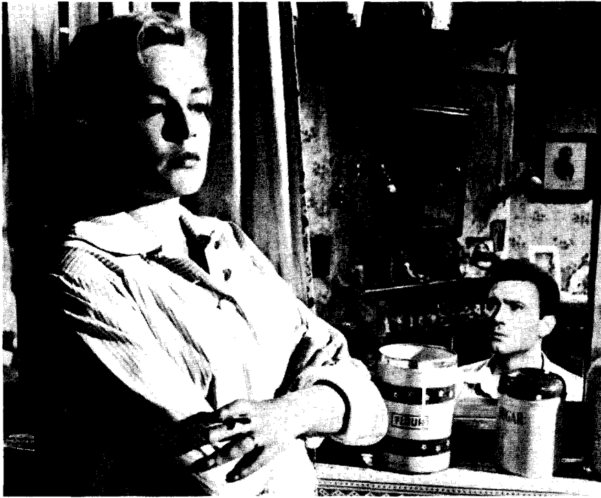
Joe (Laurence Harvey) and Alice (Simone Signoret) are contained by the shabby homeiness of working-class existence.

unacceptable contradiction by the establishment of a utopian (or, sometimes, dystopian) space where the antinomies of a text's social raw materials may be effectively closed up or off. 10 In short, if representation calls attention to what is , the narrative establishes what it means . Thus, as we shall see, the evolution of a different notion of "realism" does not necessarily signal any radical change in a text's relationship toward the "neutral and integrative coherence of public opinion." New discourses, such as the discontent of the working-class angry young man, can be readily accommodated within traditional orders of meaning through the evaluative dynamics of the storytelling process.