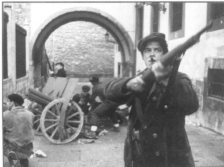
Fig. 3. Los jinetes del Alba (1990), Aranda's five-hour television series dealing with the 1934 Asturias insurrection.

woman working at Las Caldas, a spa in the northern region of Asturias. Much of the action takes place during the revolutionary events in that Spanish principality in October 1934, when miners led by anarchists, anti-Stalinists, and socialists, briefly established a commune. Aranda has noted in a television interview included in the series' DVD that Jinetes (based on a novel by Jesús Fernández Santos) was the first film ever made in Spain about the 1934 Asturias insurrection, and that the director had to research its history thoroughly. Jorge Sanz again appears with Abril, as Martín, a patient at the spa who earns his keep by handling wild Asturian horses – which appear repeatedly as a motif – and then becomes an anarchist, an illegal guerrillero after the civil war ends, and Abril's lover.