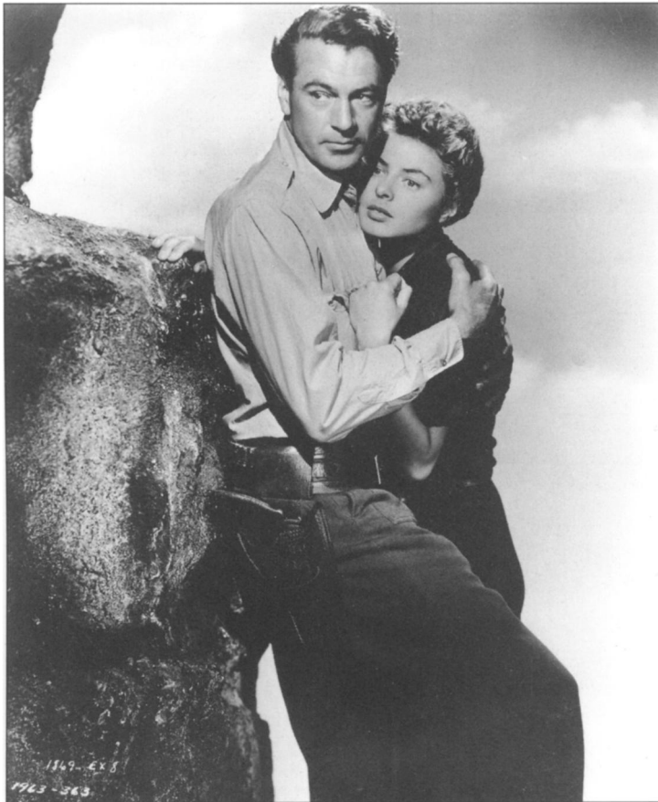
Fig. 1. Gary Cooper and Ingrid Bergman in Sam Wood's version of Hemingway's For Whom the Bell Tolls (1943).

ningly charismatic performance by Bergman as Ilse, an antifascist refugee wracked by romantic ambivalence. She played opposite Humphrey Bogart as the American Rick Blaine, made cynical, or so it seems, by his experience assisting the Spanish Republic and the Ethiopians against the forces of Hitler's Germany and Mussolini's Italy in the mid-'30s. At the end, however, Bogart/Blaine is 'welcomed back' to the antifascist struggle by Paul Henreid, playing Victor Laszlo, the 'stiff' anti-Nazi Resistance fighter.