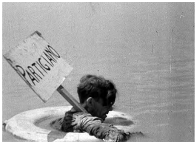
Left: Rome Open City. Right: Paisan.