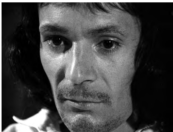
Top left: Cartesius . © 2002 Istituto Luce—Roma. Next two: The Age of the Medici . © 2003 Istituto Luce—Roma. Last three: Blaise Pascal . © 2003 Istituto Luce—Roma. DVD: Criterion Eclipse.