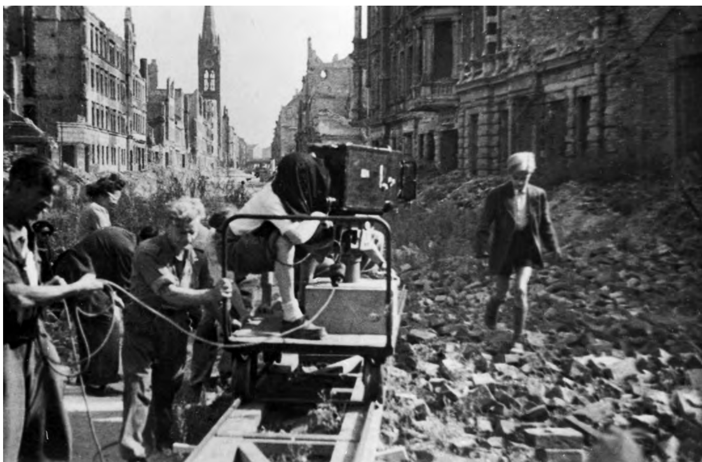
Filming Germany Year Zero in Berlin

past the rubble of Berlin before leaping to his death from an empty building. In both cases the places in which these figures move are also sites of memory. Rossellini recalled that the bodies of real partisans had remained afloat in the Po for weeks. The ruins of Berlin were a reminder of the terrible devastation wreaked by strategic bombing on the cities of Germany and of the death of over half a million German civilians, but they were also a visible sign of the internal damage done to the minds of the survivors. These shots, in which the images of the city are offset by a minimal music written by Rossellini's brother Renzo, seem to bear out Fellini's claim (in Fare un film , 1980) about Rossellini at this time having "an enormous trust in the things photographed." The camera records but it cannot explain. André Bazin wrote in his review of the film in 1949 that if we know anything about Edmund "it is never from signs that are directly readable on his face, not even from his behavior." Rossellini made Germany Year Zero while he was still grieving the death in 1946 of his nine-year-old son Romano, to whose memory it is dedicated, and he described the film in an interview with Fernaldo Di Giammatteo in November 1948, as "cold as a