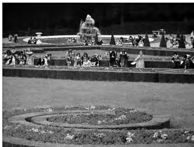
Top two: Germany Year Zero . © 1948 Cinecittà Luce, Renzo Rossellini, and Kramsie Ltd. Others: The Taking of Power by Louis XIV . © 1966/2008 INA. DVDs: Criterion Collection.