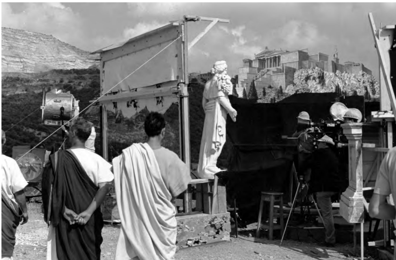
Rossellini sets up a Schüfftan mirror shot for Socrates (1971)