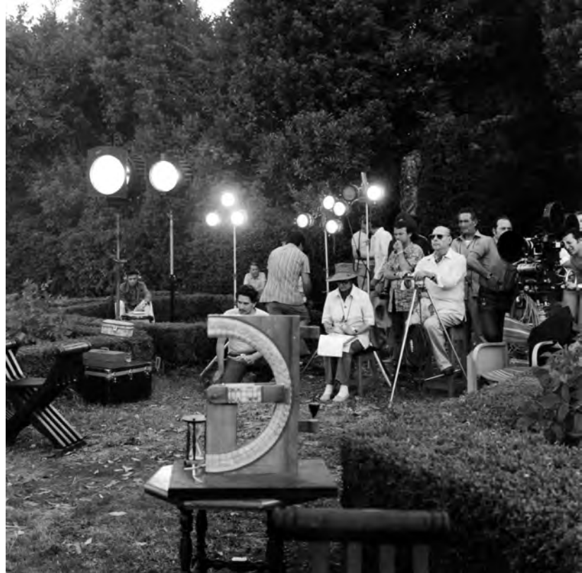
Filming Cartesius in Italy