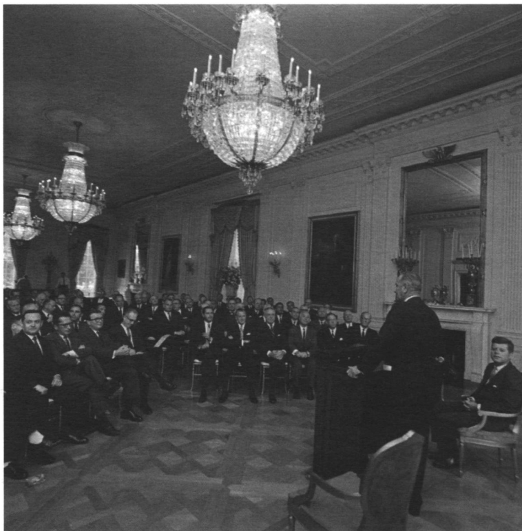
Fig. 3. Vice President Lyndon Johnson speaking to a group of business executives, June 4, 1963.

employment opportunities is also vital to a vigorous economy. It is necessary that the allocation of human resources be solely determined by the ability of the individual and that irrelevant factors, chief among which is race, be not determinative. Denial of economic opportunities to Negroes has not been confined to the South.